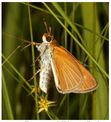
Two-spotted Skipper ( Euphyes bimacula ), 6/27/17, Berkshire Co., Bo Zaremba