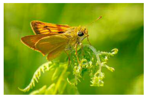
Delaware Skipper ( Anatrytone logan), 9/12/71, Shrewsbury, MA