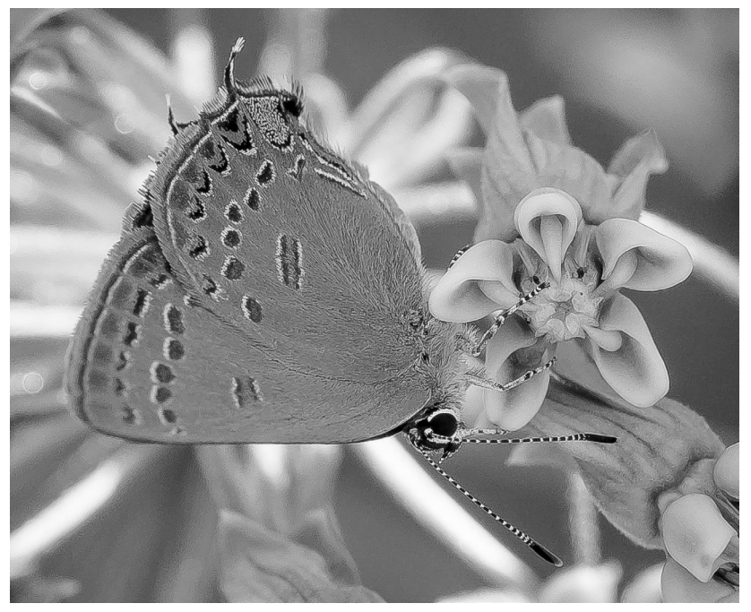
Edwards' Hairstreak ( Satyrium edwardsii ), 6/25/16, Horn Pond Mountain, Woburn, Bruce deGraaf

habitat types, the Vineyard has somewhat lower butterfly diversity than one might expect (we're especially short on freshwater wetlands). Acadian Hairstreak, Henry's Elfin, Black Dash, Delaware Skipper, Eastern Comma, and Great Spangled Fritillary are among the species that you might expect would breed on the Vineyard, but apparently don't. Finally, the relative abundance of the species that do occur here often seems different from what's observed on the mainland. Dreamy Duskywing, for example, is a genuine rarity on the Vineyard -- I record it maybe once every three or four years, always in very low numbers -- while Sleepy Duskywing can be downright abundant. And Edwards' Hairstreak always far outnumbers the other Satyriums.