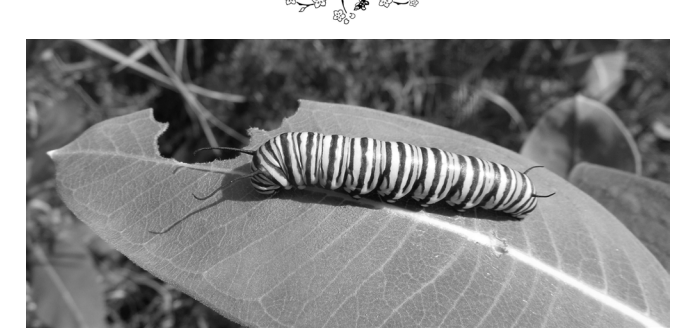
Monarch caterpillar ( Danaus plexippus ) on Common Milkweed, 9/5/17, Graves Farm, Williamsburg, MA, Bill Benner

https://www.massaudubon.org/content/download/8035/145099/file/gravesfarm trails.pdf