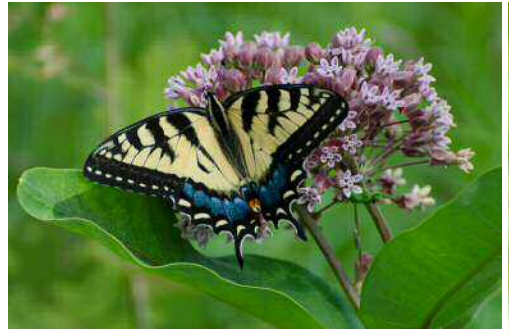
Eastern Tiger Swallowtail ( Papilio glaucus ), 7/20/17, Williamsburg, MA, Carol Duke