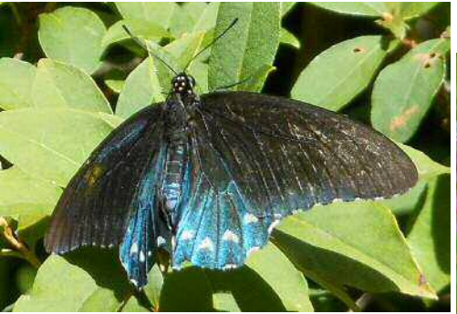
Pipevine Swallowtail, ( Battus philenor ), 9/1/17, Jamaica Plain, Lucy Merrill-Hills