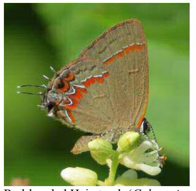
Red-banded Hairstreak ( Calycopis cecrops), 8/26/17, Mattapoisett, MA

Monarchs ( Danaus plexippus), 8/24/17, Falmouth, MA