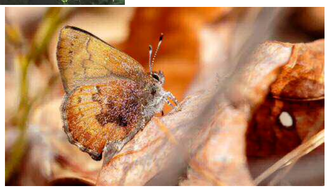
Brown Elfin (Callophrys augustinus), 4/24/17, Broad Meadow Brook, Worcester, MA