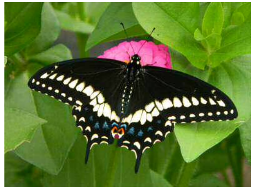
Black Swallowtail ( Papilio polyxenes ), 8/7/17, West Bridgewater, MA, Don Adams