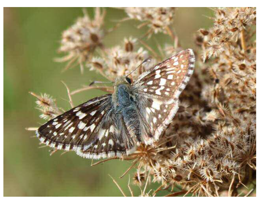
Common Checkered-Skipper ( Pyrgus communis), 9/22/17, Northampton, MA