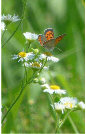
American Copper ( Lycaena phlaeas ), 7/8/17, Alan Rawle