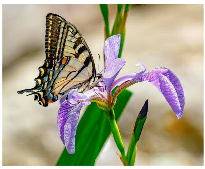
Tiger Swallowtail sp. ( Papilio glaucus sp. or hybrid), 6/18/17, Shrewsbury, MA, Bruce deGraaf