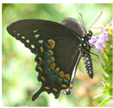
Spicebush Swallowtails( Papilio troilus); above: 8/6/17, Belchertown, below: 8/24/17, Bristol, MA